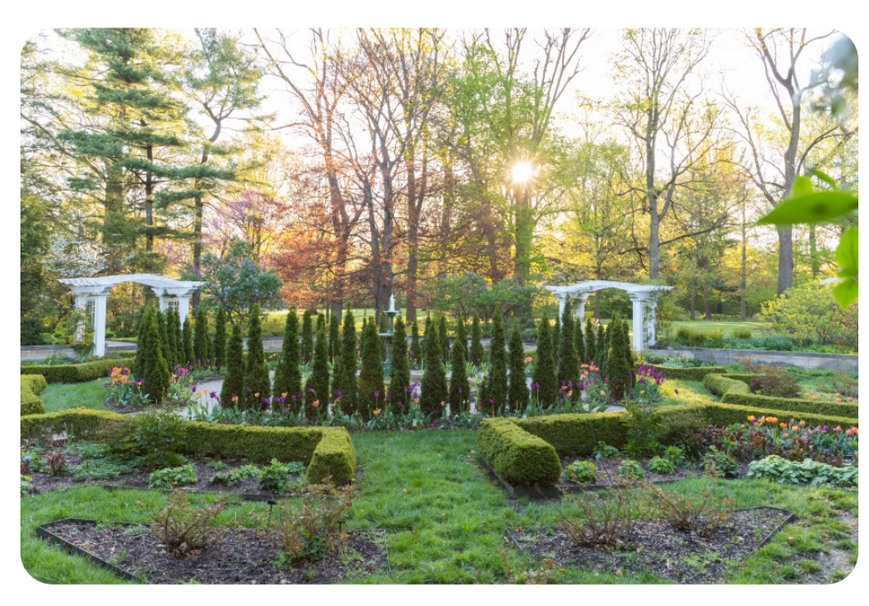
*Available only with rental of a reception space. Venue rental fee includes 100 white resin chairs. Additional chairs are available through Newfields for $5.50/chair plus the cost of delivery. No tenting or food permissible. Limited beverage service is available for an additional fee through the caterer. Additional fee for custom ceremony chair layout. All décor is subject to Newfields' approval.