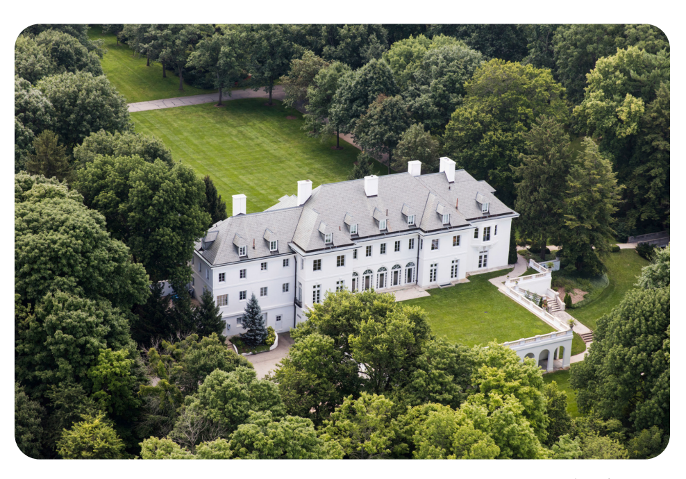
*Available only with rental of a reception space. The venue rental fee includes 100 white resin chairs. Additional chairs are available through Newfields for $5.50/chair plus the cost of delivery. No tenting or food permissible. Limited beverage service is available for an additional fee through the caterer. Additional fee for custom ceremony chair layout. All décor is subject to Newfields' approval. Lilly Terrace rental does not include access to Lilly House or lower loggia.