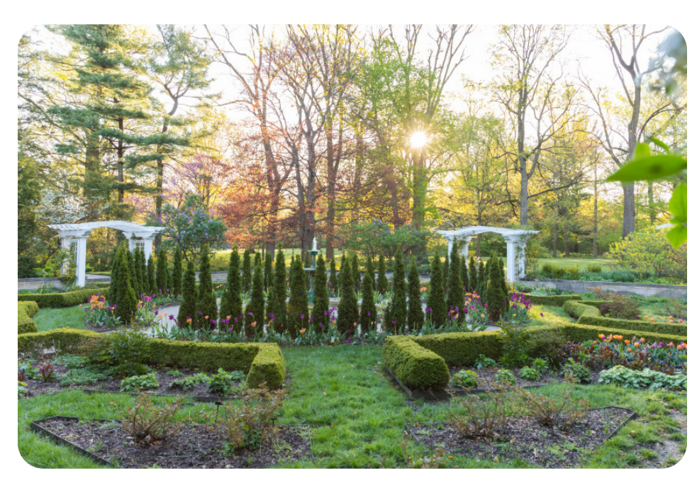
*Available only with rental of a reception space. Venue rental fee includes 100 white resin chairs. Additional chairs are available through Newfields for $5.50/chair plus the cost of delivery. No tenting or food permissible. Limited beverage service is available for an additional fee through the caterer. Additional fee for custom ceremony chair layout. All décor is subject to Newfields' approval.