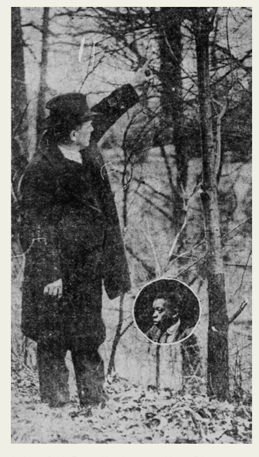
Indiana Daily Times, March 17, 1922, Home Edition, pg. 13. Library of Congress Chronicling America: Historic American Newspapers.

The articles talked more about the branches those murderers took from the tree than the life they snatched away from us.